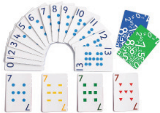
School Friendly Playing Cards