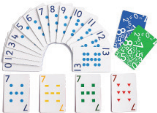
School Friendly Playing Cards