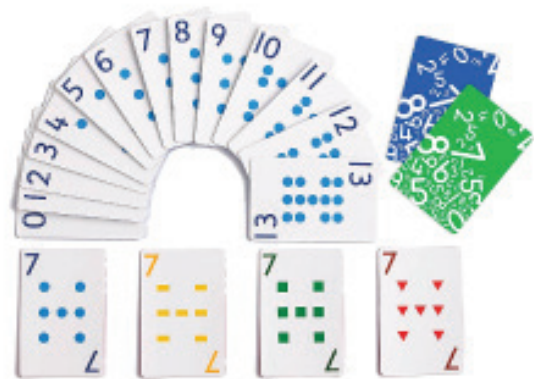
School Friendly Playing Cards