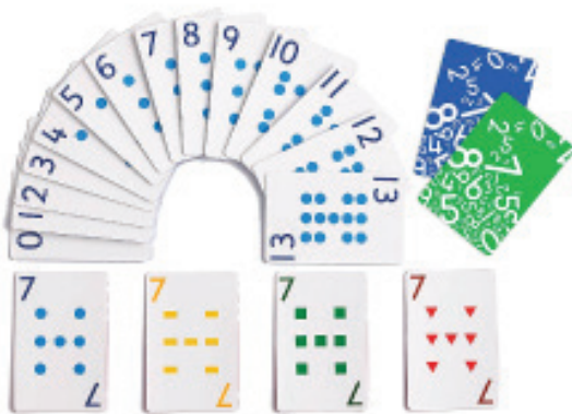
School Friendly Playing Cards