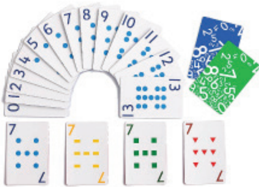
School Friendly Playing Cards