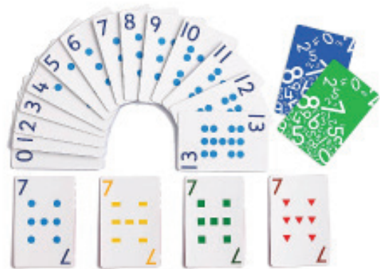
School Friendly Playing Cards